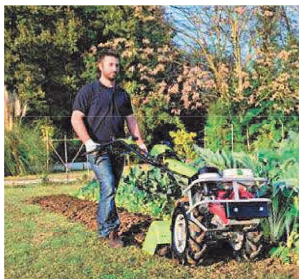
G 108 GX 270 Honda